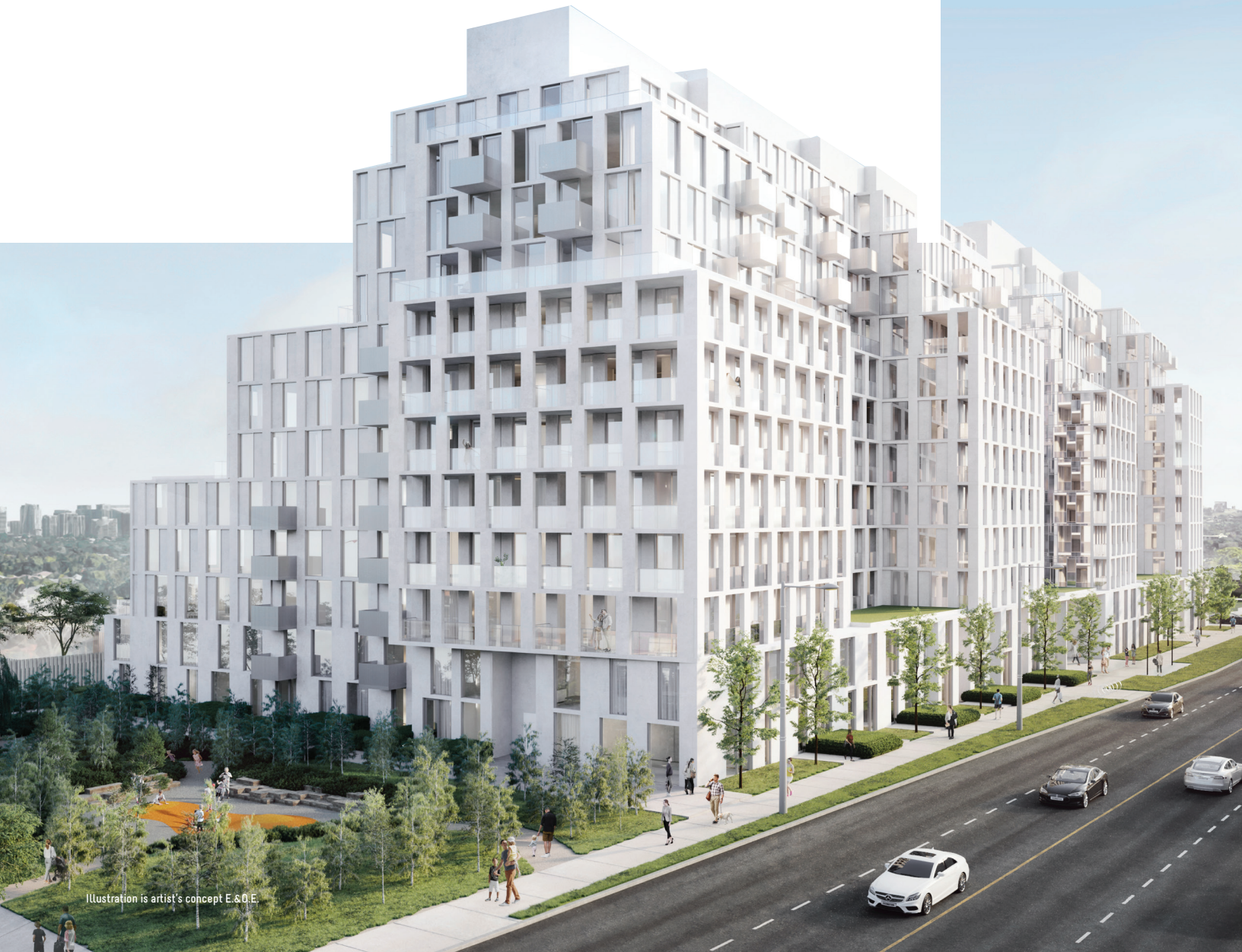
Illustration is artist's concept E.&O.E.