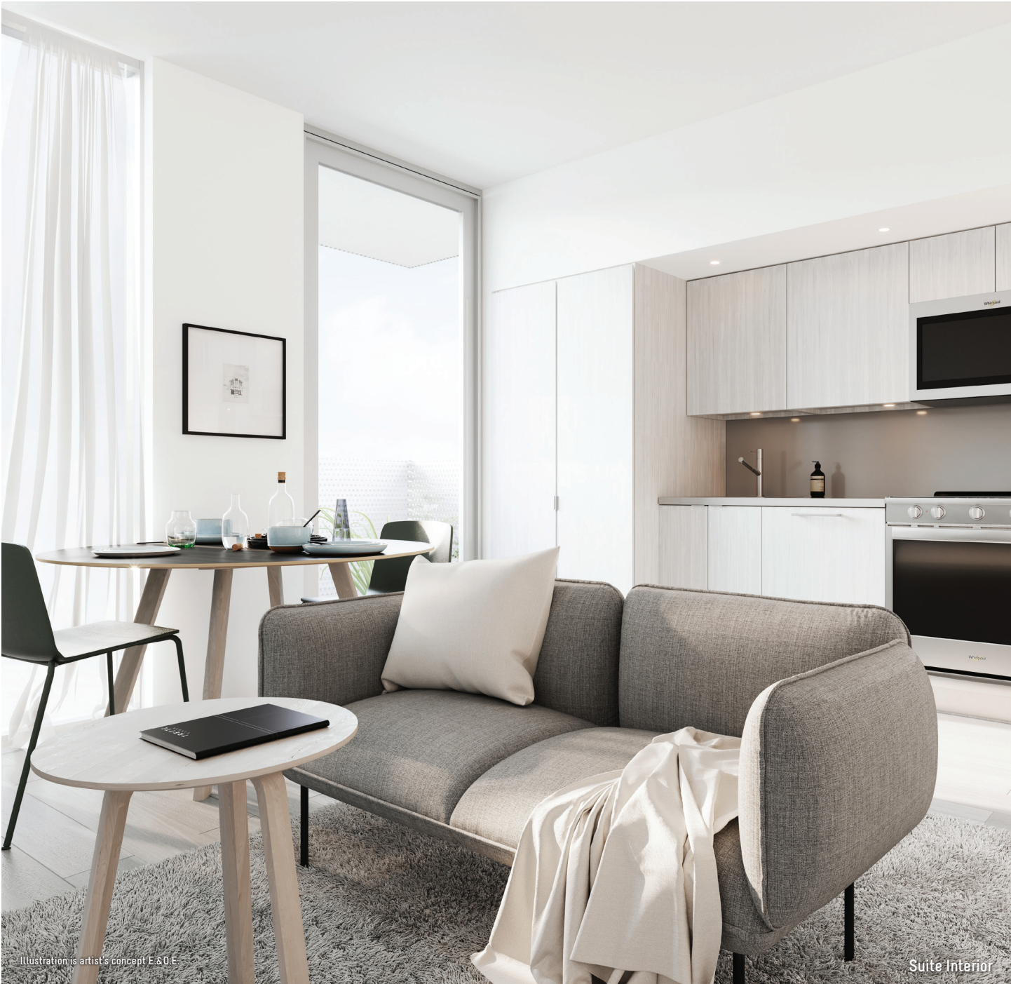
Illustration is artist's concept E.&O.E