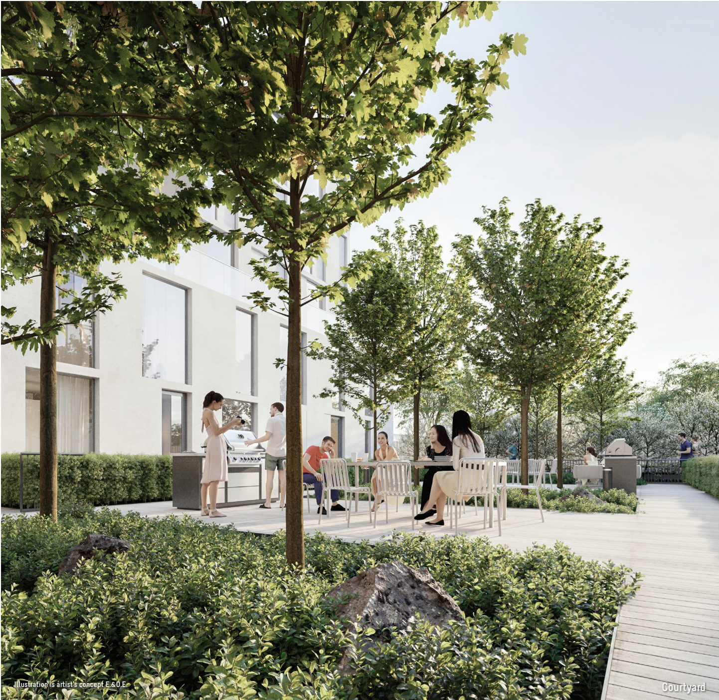
Illustration is artist's concept E.&O.E.