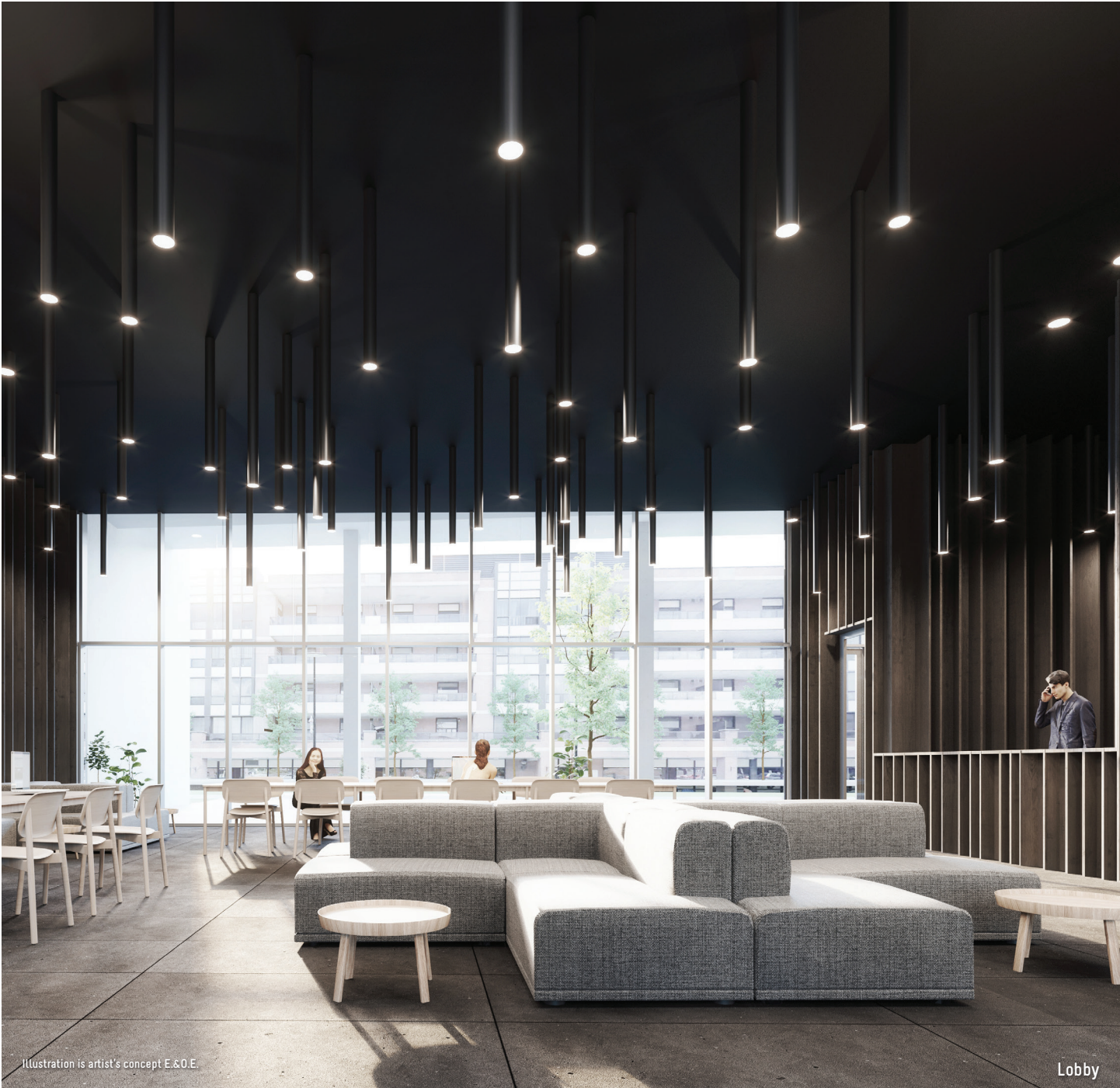
Illustration is artist's concept E.&O.E.