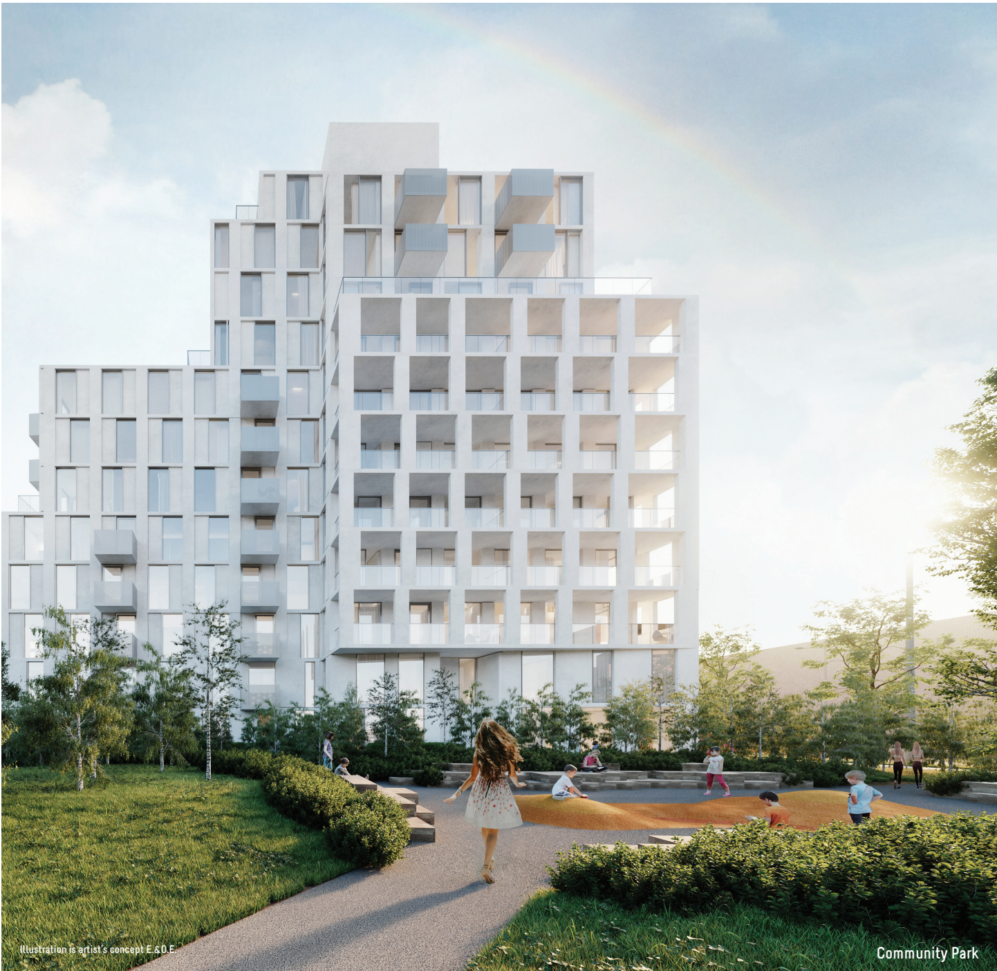
Illustration is artist's concept E.&O.E