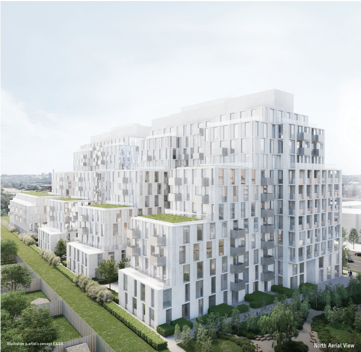
Illustration is artist's concept E.&O.E.